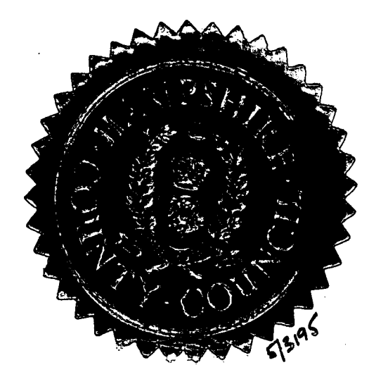
Clerk of the County Council